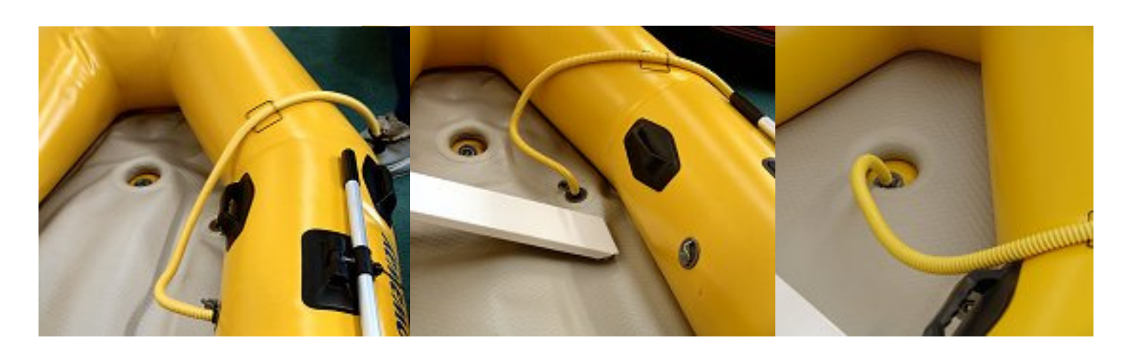
Fig. D Fig. E Fig. F

Inflate the floor of your boat to 60kPa / 10psi so it feels hard (Fig. E) and inflate the keel to the same pressure as the floor (Fig. F). To pump volume air keep the black plug in place. To pump pressure remove the plug.