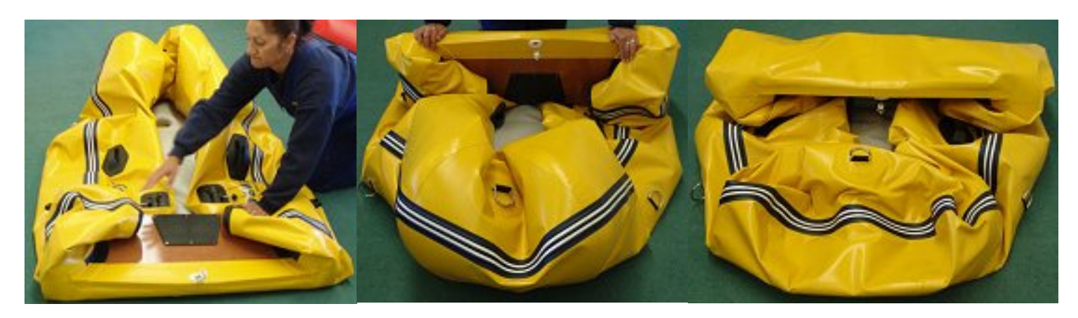
Fig. I Fig. J Fig. K

Roll the boat over the transom towards the front pushing the air out. See Fig. J and K. Repeat if necessary.