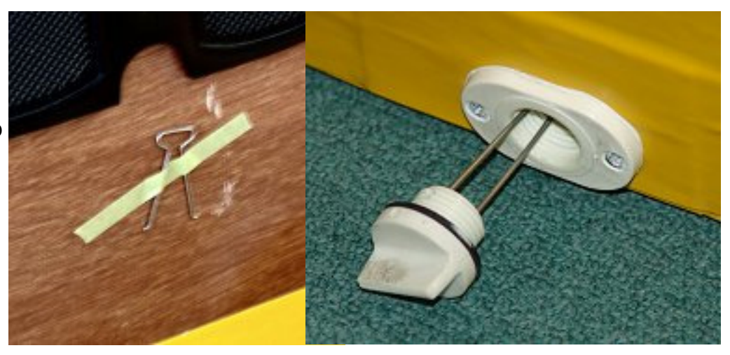
Fig. G Fig. H